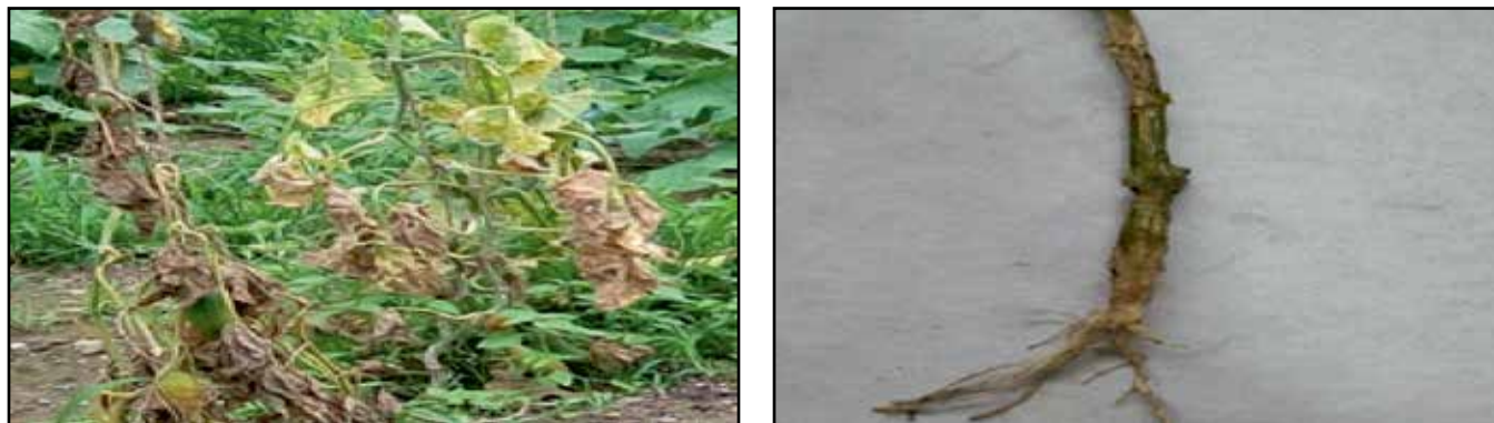
Fig 1: Symptoms of Fusarium wilt of cucumber

cylindrical) were raised in pots filled with sterilized soil. Seedlings at about 3-4 true leaf stage (21 days old) were transplanted in poly bags inoculated with mass culture of Fusarium oxysporum . The polybags were placed in glass house, observed for symptom development and incubation period (days) was recorded.