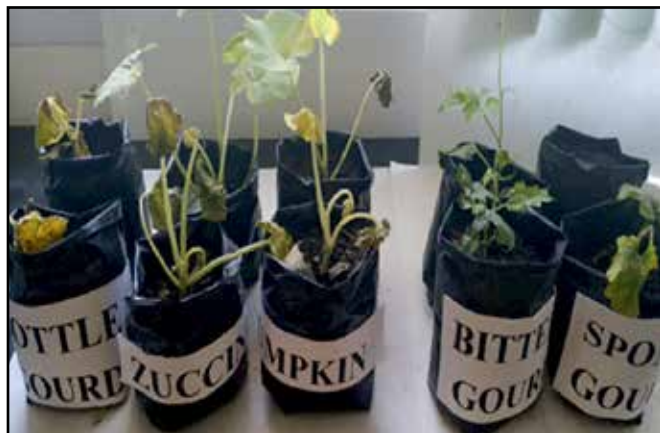
Fig 4: Evaluation of host range of Fusarium oxysporum under pot conditions