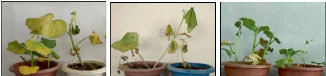
Fig 3: Pathogenicity test of Fusarium oxysporum under pot conditions

Incidence of Fusarium wilt in cucumber growing areas of mid hills of Himachal Pradesh varied from 5 to 43 per cent with mean disease incidence of 13.53 per cent. Among different methods of inoculation used for proving pathogenicity of Fusarium oxysporum , soil inoculation by mass culture method was found best with least incubation period of 10 days. Except bitter melon, all the cucurbits were found susceptible to the disease.